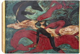
Le Ngoc Linh – Lacquer as an inner dialogue ( https://www.leauctions.vn/le-ngoc-linh-son-mai-nhu-mot-cuoc-doi-thoi-noi-tam/ )