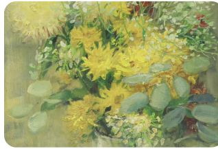
SILENT FLOWER COLORS IN LE PHO'S PAINTINGS ( https://www.leauctions.vn/sac-hoa-lang-tham-trong-hoi-hoa-le-pho-2/ )