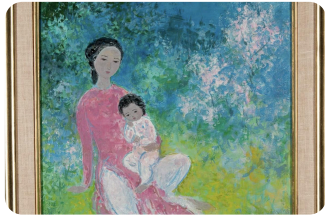
VU CAO DAM – “MOTHER AND CHILD”, 1984 ( https://www.leauctions.vn/vu-cao-dam-me-va-con-1984/ )