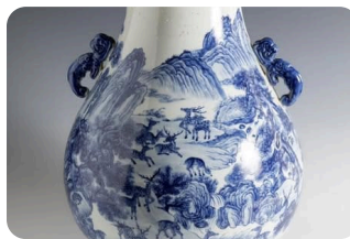
Blue glazed ceramic vase with lake shape and “Lucky – Pine – Peach” theme ( https://www.leauctions.vn/binh-gom-hinh-ho-ve-men-lam-de-tai-loc-tung-dao/ )